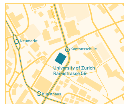
Bus 31 or tram 3 from Bahnhofplatz/HB to Kunsthaus, then walk up to Rämistrasse 59.